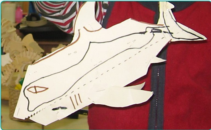
Sharks with teeth and moving jaws